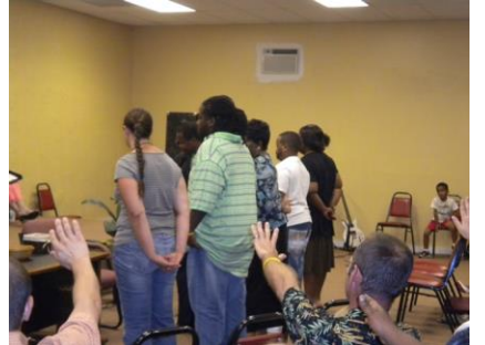
People in the front for healing in their lives

"You will press yourself for trouble. Can you survive? Will you give up because you had a liver transplant, a divorce, lost your job? Problems are part of life. Do you have problems with your kids? My son is 16. I don't know how old Satan was when he rebelled against God, but I think about 16. I finally spanked him. Now he gets straight A s. No trouble. When they tell you never to spank your children, that it is against the law, don't listen. That is not what the Bible says. The Bible says the man who spares his rod hates his son. It works. Just remember not to use something hard that will leave a mark so you won't go to jail.