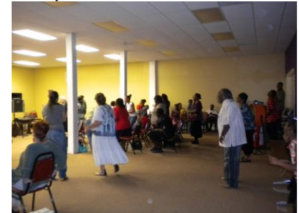
People in worship at the 2<sup>nd</sup> night of revival

"I have been married to the same woman for 22 years. Anyone can get married, but not everyone can keep their marriage. Where I come from there is a saying: When elephants fight, it is the grass that is damaged. In Divorce, it is the children that are devastated. I 'm not saying this for you to feel bad if you are divorced; just keep the one you have now.