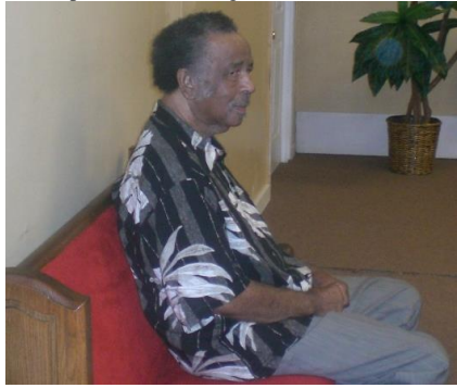
Bishop Clyde Patman

People on the first night of the revival