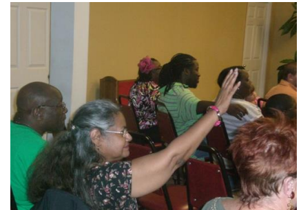
Worship at the revival night #2

"Job 14:1 tells us, 'Man that is born of a woman is of few days, and full of trouble.' You see, if we are born of a woman we are full of trouble. Deep trouble calls for deep prayer. If you are born of a woman, your entire life will be infested with trouble. That is normal. It is a lie that when you come to Jesus you'll have no problems. You are who you are because of God. You either in a problem, coming out of one or getting ready to go into one. Problems are like rain. You cannot stop the rain. You just need an umbrella.(Cont. on pg. 4)