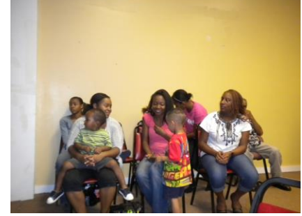
People enjoying Carol's coffee house