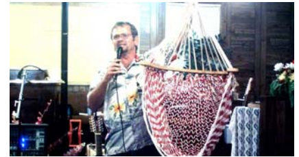
The hanging chair