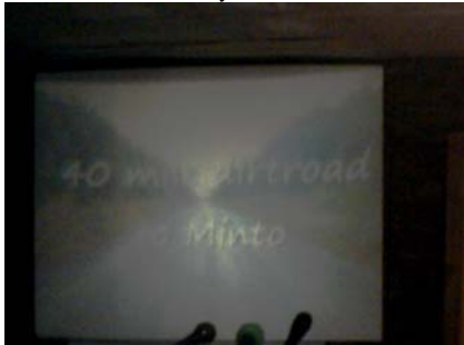
Slides of the Minto trip 2012