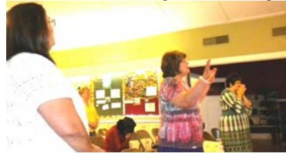
Women in worship