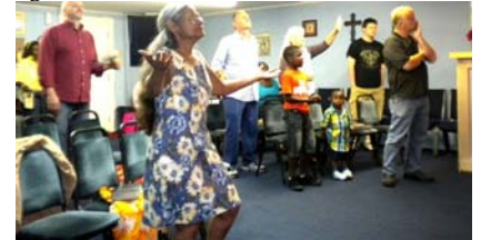
The people of God in worship

are yours. Power! The mentality we see too often is: It's been this way for several years. I guess I'll live this way until Jesus comes back. The devil is a liar! If you say, 'I don't know what to do,' let me help you. Give and live right.