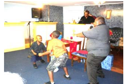
The overflow dance

"You don't preach to disciples the same way you preach to sinners. If you want corn, you have to plant corn. If you want money, you have to plant money." The offering did yield a little more than was hoped for. Therefore, the "Overflow Dance" was done.