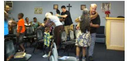
Folks greeting one another

"You don't preach to disciples the same way you preach to sinners. If you want corn, you have to plant corn. If you want money, you have to plant money." The offering did yield a little more than was hoped for. Therefore, the "Overflow Dance" was done.