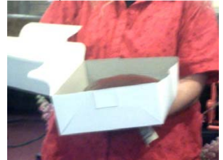
The chocolate cake