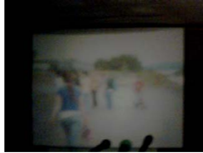
The kids in Minto

"Christian" missionaries had been there in the 1960s and those who were children then were tortured by these "Christians," disallowed from speaking their native language, and taken away from their parents, among other horrible things.