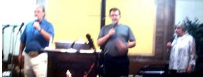
The Mitchells in concert