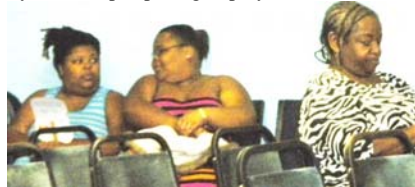
Some of the people at the seminar