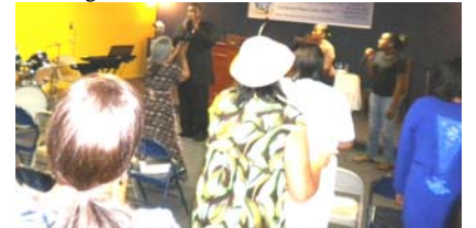
People of God in worship

“Paul told the centurion that bad things would happen, but the Roman preferred to listen the one he wanted to believe. Something is gonna happen if you don’t believe the word of God. Warning comes before disaster.