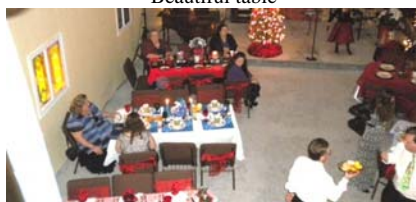
Men serving the women