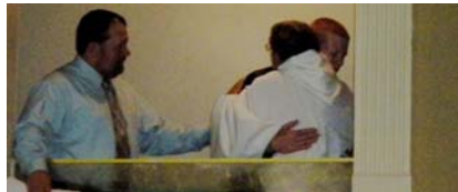
A wet hug