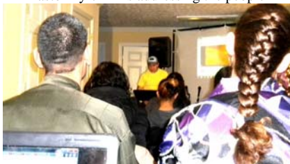
The people bringing in the New Year joyously worshipping God

It was a wonderful time for all who were present, beginning the New Year in worship.