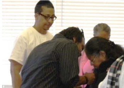
People being prayed over

People were prayed over at the end of the service.