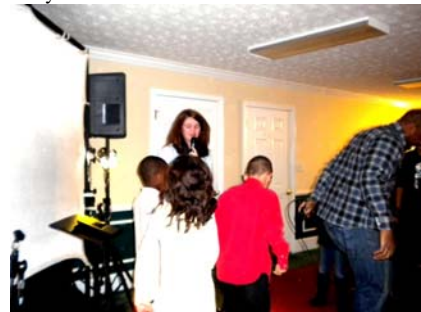
Watch Night Service at Encounter church in Hoschton. Adults and children saw the New Year in with worship of God

On 31 December 2013 there were several Watch Night services in the five counties of the Whole Body of Christ Alliance. Cover which one?