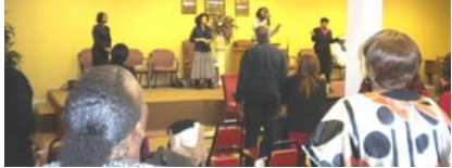
People in worship

I know there are people who didn't like what I said, but it's all He gave me to say. After that first fight, people are gonna drop that evangelist.