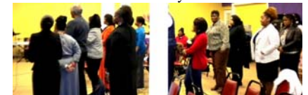
Close your eyes; take 4 steps forward, 4 back