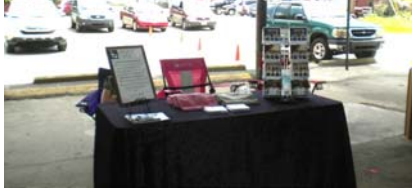
CDs and other things