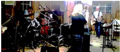
Unity on a Mission

Rhonda's Coffee House occurs on the first Saturday of the second month of every quarter: February, May, August, November. On 3 May there was another Rhonda's Coffee House.