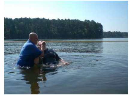
I become completely immersed in Bible Knowledge

14: What king of Israel experienced a long famine and drought during his reign?