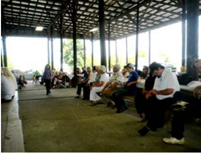
Some of the 250 plus people who came to listen

Jackson County court house on 16 June at 1800 (6pm). They immediately went into God Bless America Again .