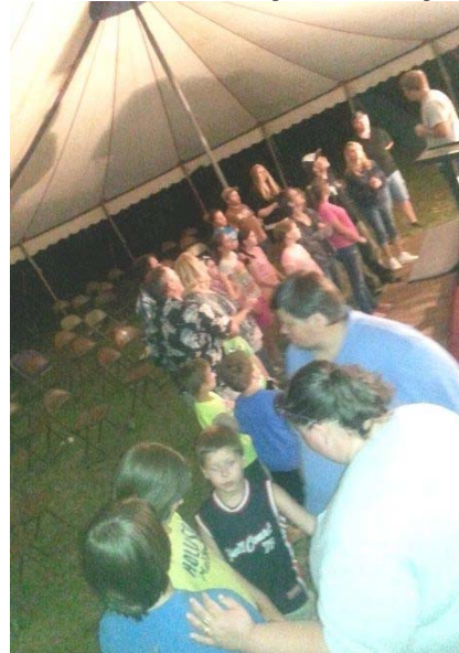
One night at the revival

There was a tent revival in Braselton from 4 May to 10 May. It was kicked off on Sunday 4 May with a hot dog grill and drinks, with gospel music from 1300 to 1600 (4pm). At 1900 (7pm)