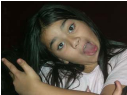
Guess I better read the Bible some more