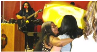
People loving on each other