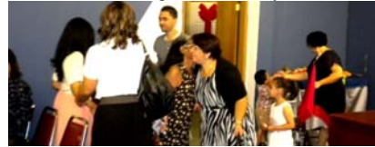
People greeting one another with hugs