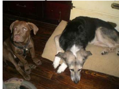
I'm bored, let's look at the Bible Knowledge

5: What king of Judah showed mercy when he executed his father's murderers but spared their families according to the Law of Moses?