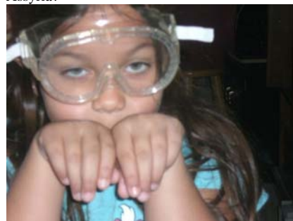
I like the strange creatures in Bible Knowledge

12: What king of Israel had much of his territory taken away by Tiglath-Pileser, the king of Assyria?