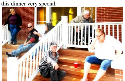
Hanging out on the front porch

Made an excellent beef chili, and along with several other things made by other people made