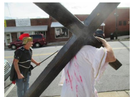
The Villa Dolorosa