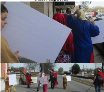
Behind the cross