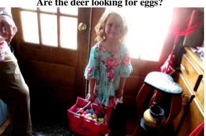
Lots of eggs