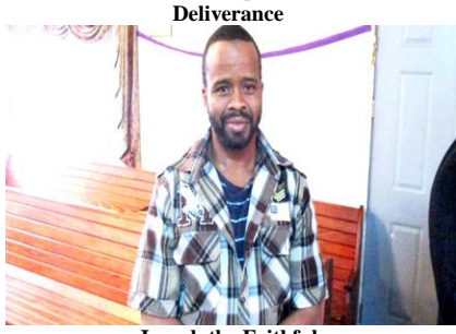
Joseph the Faithful