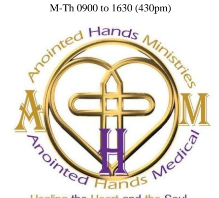
Healing the Heart and the Soul