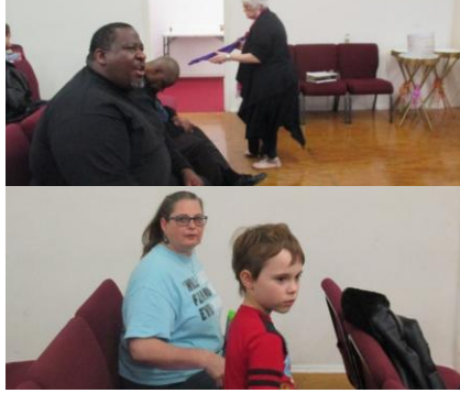
"These have gifts and callings no one else has. They are being called forth and given names - the tombs of the unknown. People told them you were nothing, that you don't have a father, no mentor.

"God says, 'I have raised up fathers in this season with the want of God to speak into their lives.' God does not see them as they are, but as they will be. We must speak into their lives and tell them.